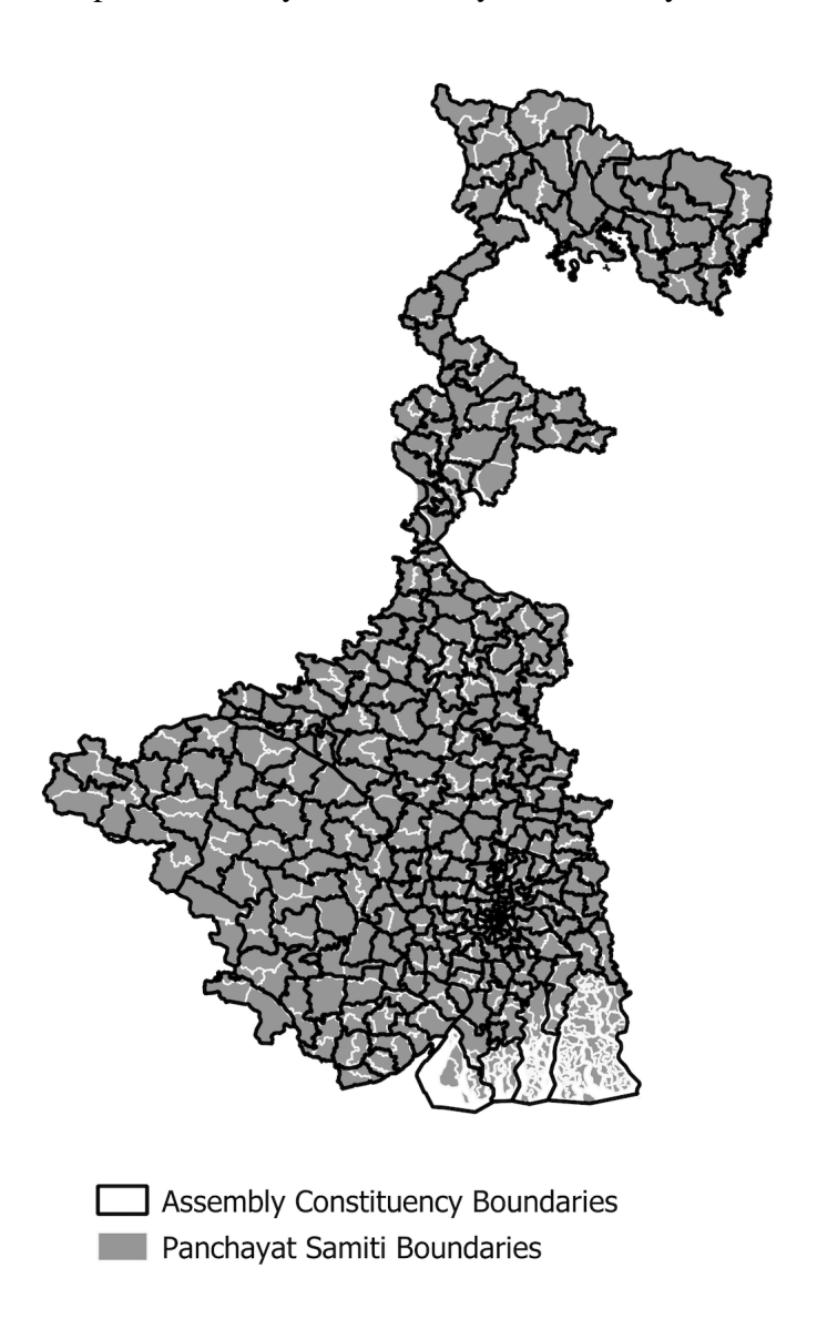
Figure A1: Overlap of Assembly Constituency and Panchayat Samiti Boundaries

Note. This figure shows the extent of overlap between Assembly Constituencies (AC) and Panchayat Samiti (PS) boundaries in West Bengal. The median of the area overlap between a PS and GP was 87%, and mean was 71%. In 70% of GPs in our sample the corresponding MLA was from the same party that controlled the PS.