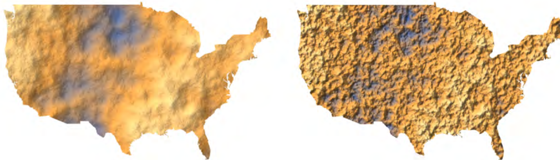
Figure 3: Sample Realizations of Y with Different Underlying B Y with B = B_1 Y with B = B_2

Notes: B_1 and B_2 are zero mean Gaussian processes with spectral densities f_1(\omega) \propto 1/(|\omega|^2 + 100^2)^{3/2} and f_2(\omega) \propto (|\omega|^2 + 50^2)^{3/2}/(|\omega|^2 + 200^2)^3 for \omega \in \mathbb{R}^2 , respectively, where the width of the contiguous U.S. is normalized to unity.