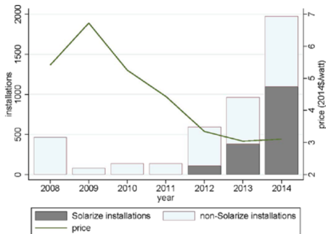
FIGURE 1. Trends in installations and average post-incentive system price.